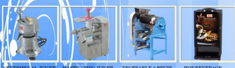
CENTRIFUGAL JUICER MASTICATING JUICER VEGETABLE & FRUIT PULPER HOT BEVERAGE VENDING MACHINES