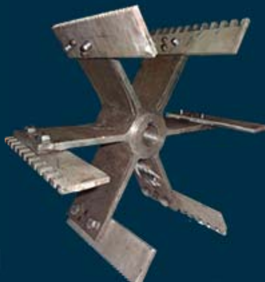
Rotor of hers & spice Grinder