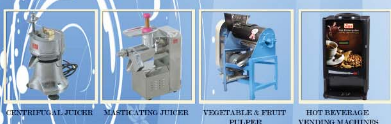
CENTRIFUGAL JUICER MASTICATING JUICER VEGETABLE & FRUIT PULPER HOT BEVERAGE VENDING MACHINES