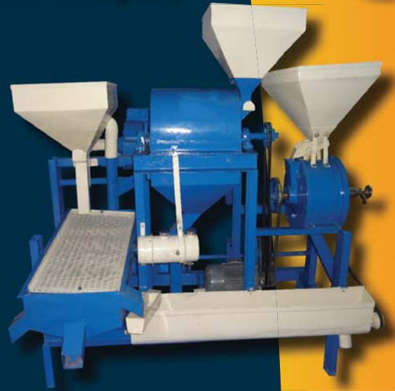
Front View of Mini Dal Mill

Jas enterprises offer mini dal mill. This mini dal mill is simple