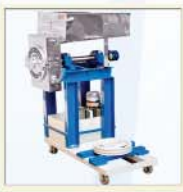
JACKETED MINI PULVERIZER