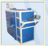
TRAY DRYER DRYING OVEN