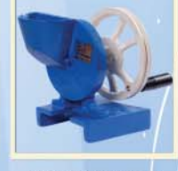
DRY FRUITS CHIPS MAKING MACHINE