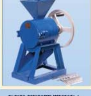
DRY FRUIT TUKDA MACHINE