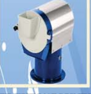
MULTIPURPOSE DRY FRU CHIPS & POWDER MACHIN