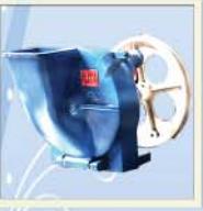
HAND OPERATED POTATO CHIPS MAKING MACHINE