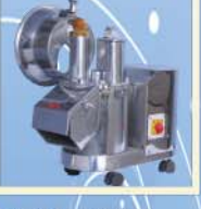
MULTIPURPOSE VEGETABLE CUTTER