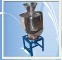
POTATO CHIPS CRISPS MAKING MACHINE