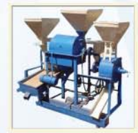
MINI DAL MILL