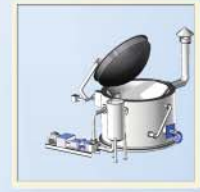
CIRCULAR BATCH FRYER