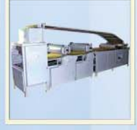
PAPAD MAKING MACHINE