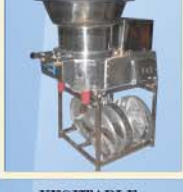
VEGETABLE SLICER, DICER, GREATER