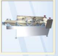
RAW CHAPATI MAKING MACHINE