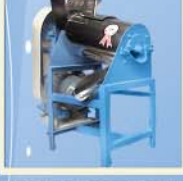
VEGETABLE & FRUIT PULPER