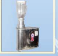
ECONOMIC MIXER GRINDER BLENDER