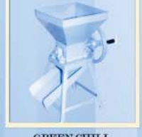
GREEN CHILL ONION CHOPPER