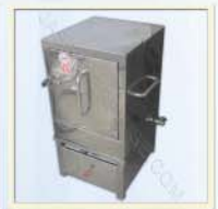
IDLI DHOKLA MOMOS STEAMER