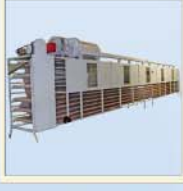
CONTINUOUS PAPAD DRYER