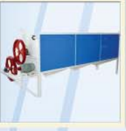
CENTRIFUGAL SIEVES / SIFTER