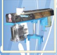
MKEEN MAKING MACHINE