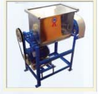
SINGLE PADDLE MIXER 'U' TYPE