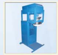
VERMICELLI MAKING MACHINE