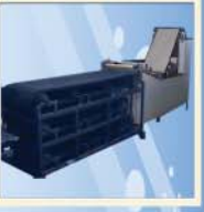
AUTOMATIC CHAPATI MAKING MACHINE