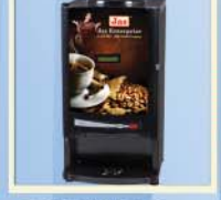
HOT BEVERAGE VENDING MACHINES