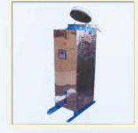
SEMI AUTOMATIC CHAPATI MAKING M/C