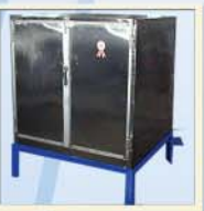
NOODSLE STEAMING MACHINE