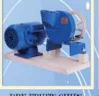
DRY FRUITS CHIPS MAKING M/C WITH MOTOR