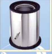
CENTRIFUGAL DRYER MACHINE