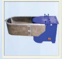
BANANA WAFER MACHINE