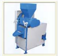
BLACK PEPPER DAL MAKING MACHINE