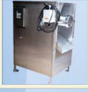
DOUGH KNEADER WITH EXTRUDER