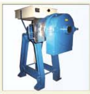
MULTI CAMBER PULVERIZER