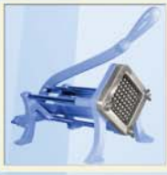
FRENCH FRY MAKING MACHINE